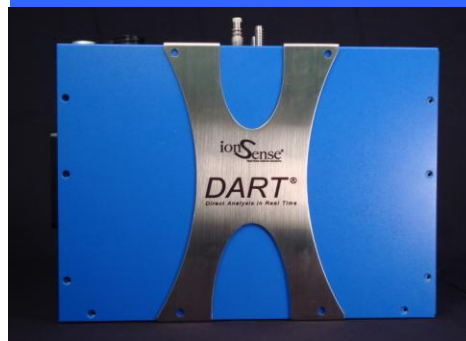
SVP Controller front view