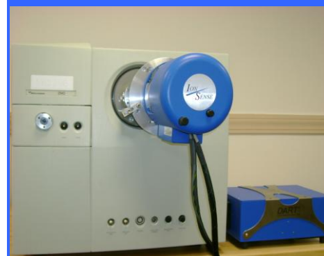
DART 100 S with SVP Controller mounted on Waters ZMD