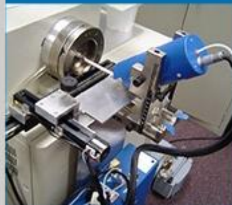
Scanner on JMS AccuTOF