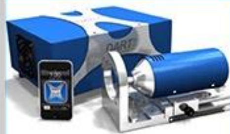
DART SVP with 3+D Scanner