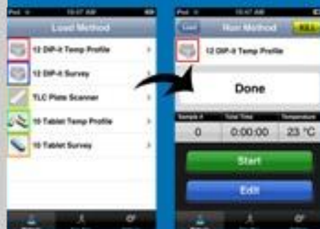
The iPod touch interface makes method development easy